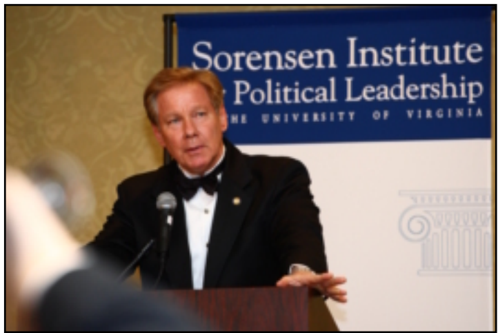
Former U.S. Congressman Tom Davis was among the speakers at the 2009 Gala