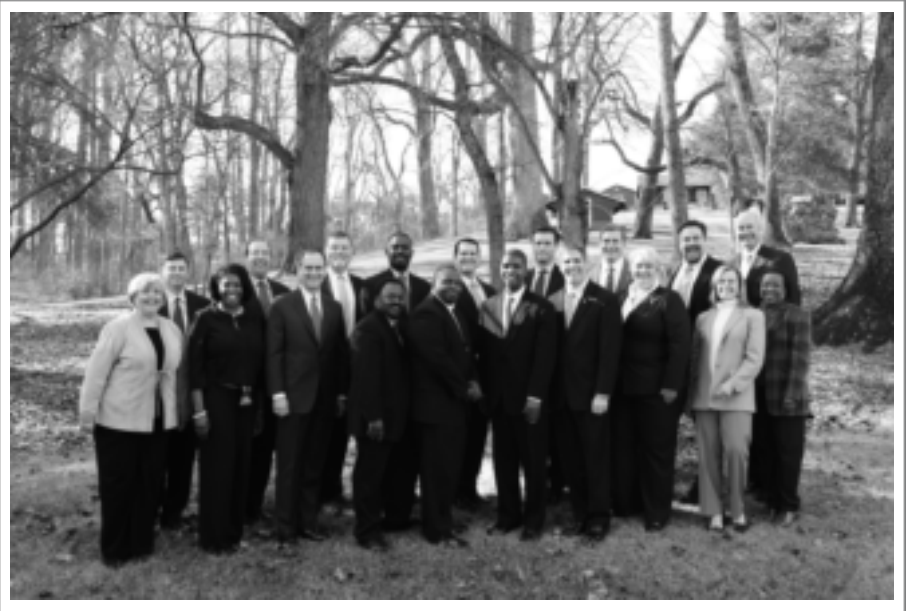
Candidate Training Program Class of Winter 2009

Due to overwhelming demand and a generous grant from the Claude Moore Charitable Foundation, we are able to offer the Candidate Training Program for a second time this year. The Spring 2009 CTP will be held May 14-17 at historic Carter Hall in Millwood, Clarke County.