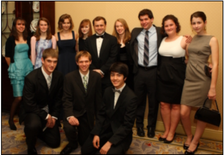
Members of the Young Liberals Club from Charlottesville-area high schools with Congressman Tom Perriello