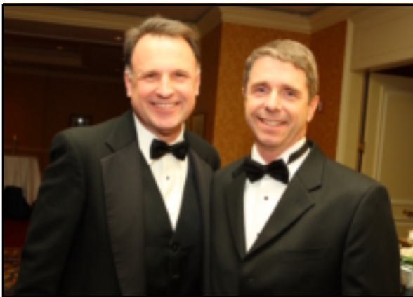
Virginia State Senator Creigh Deeds and U.S. Congressman Rob Wittman