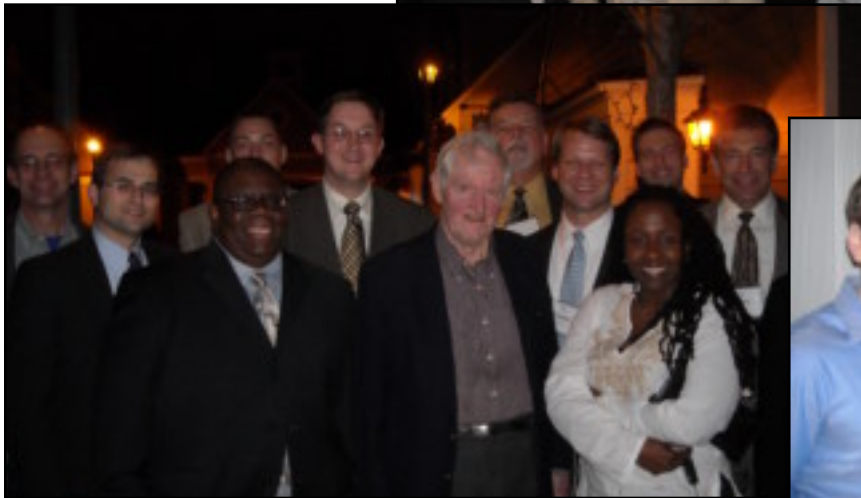
Members of the PLP Class of 2009 with former Virginia Governor Linwood Holton.