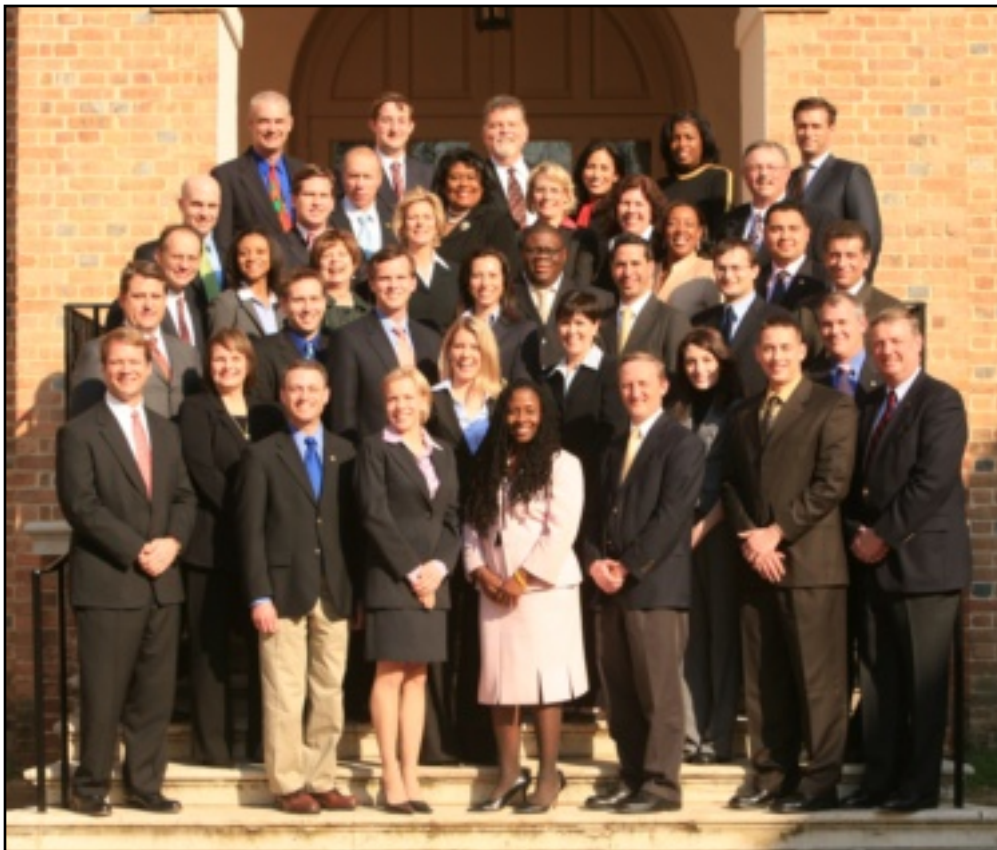
The Political Leaders Program Class of 2009

The Political Leaders Program Class of 2009, thirty-nine members strong, gathered for its inaugural session in Williamsburg on Thursday, March 5. This year's outstanding PLP class represents the spectrum of political leanings and is very evenly balanced among Republicans, Democrats and independents. Geographically, the class hails from throughout Virginia and reflects the Commonwealth's diverse population. The class members are of a