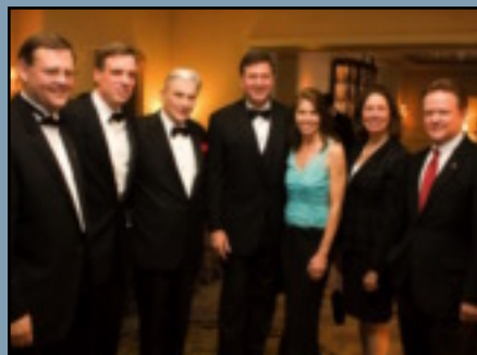
See a complete slideshow of Gala photos