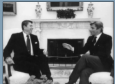
Watch a slideshow of photos from the life of John Warner