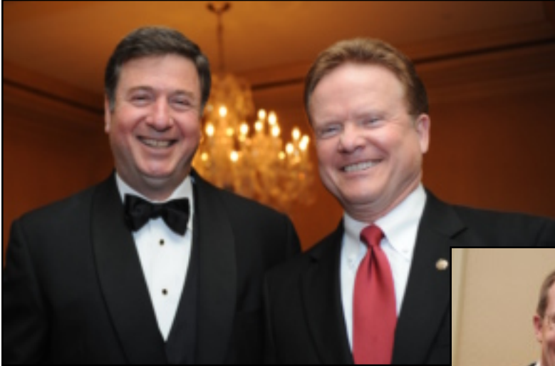
LEFT: Former Governor and U.S. Senator George Allen and U.S. Senator Jim Webb.